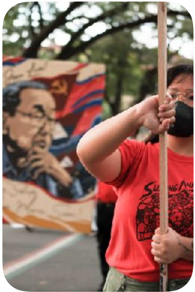
People's organizations march inside UP-Diliman to pay tribute on December 19, 2022

When the encamped enemy tires out and retreats, it is the turn of the NPA to make the advance and deliver more offensive blows. But even while the enemy seems to have the upper